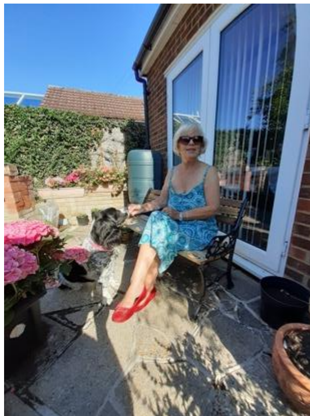
Poppy the Springer Spaniel from next door, who visits twice a day under the fence-for treats.