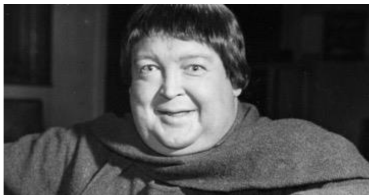
"Rochester Cathedral! Thursday 28 th October 2021. "How many sandwiches"!?"