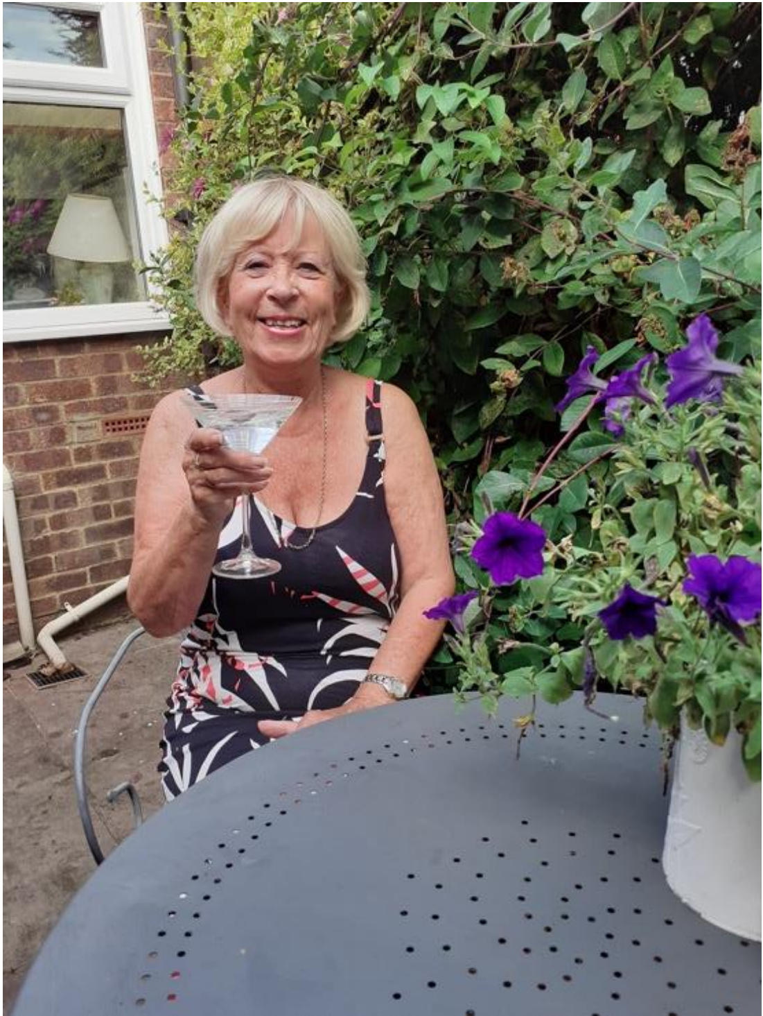
Petunia, the Gardener's Daughter say's, "Always drink plenty of water in hot weather"!

Do feel free to contact me for any help, or just a chat.